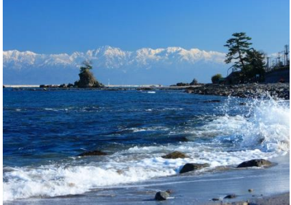
The Tateyama Mountain Range rising above Toyama Bay

Send the application form and required documents by email