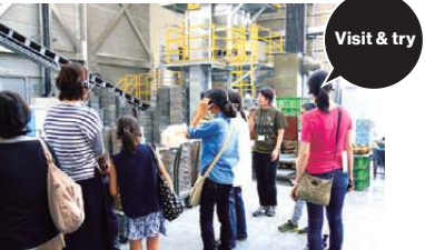
Visit & try

Producing incense burners using superior techniques in casting and engraving