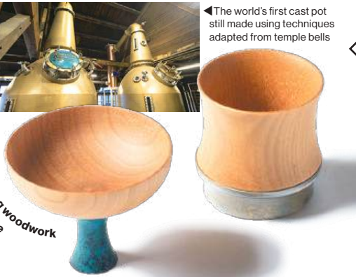
Combining woodwork with copperware

In addition to the alloys of copper and zinc, lead, and tin that have been used up to now, the local foundries are also working on new styles using 100% tin or aluminum. They also make excellent use of techniques to color metal by corroding it, while opening up a new world for Takaoka copperware in areas like tableware.