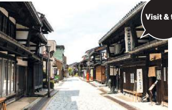
Visit & try

Kanayamachi is the home of Takaoka casting. In addition to the Takaoka Casting Museum, there are other stores displaying and selling casting wares or other places where visitors can try out making their own accessories in cast metal.